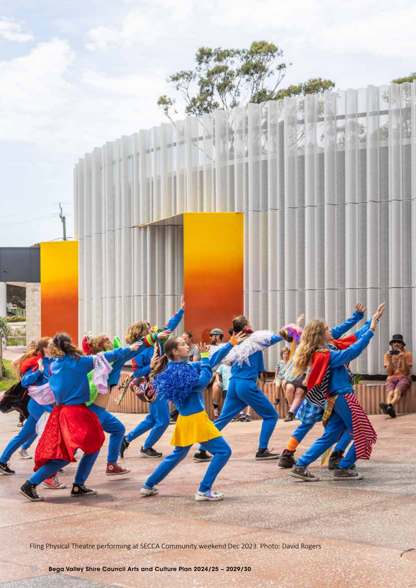
Fling Physical Theatre performing at SECCA Community weekend Dec 2023.