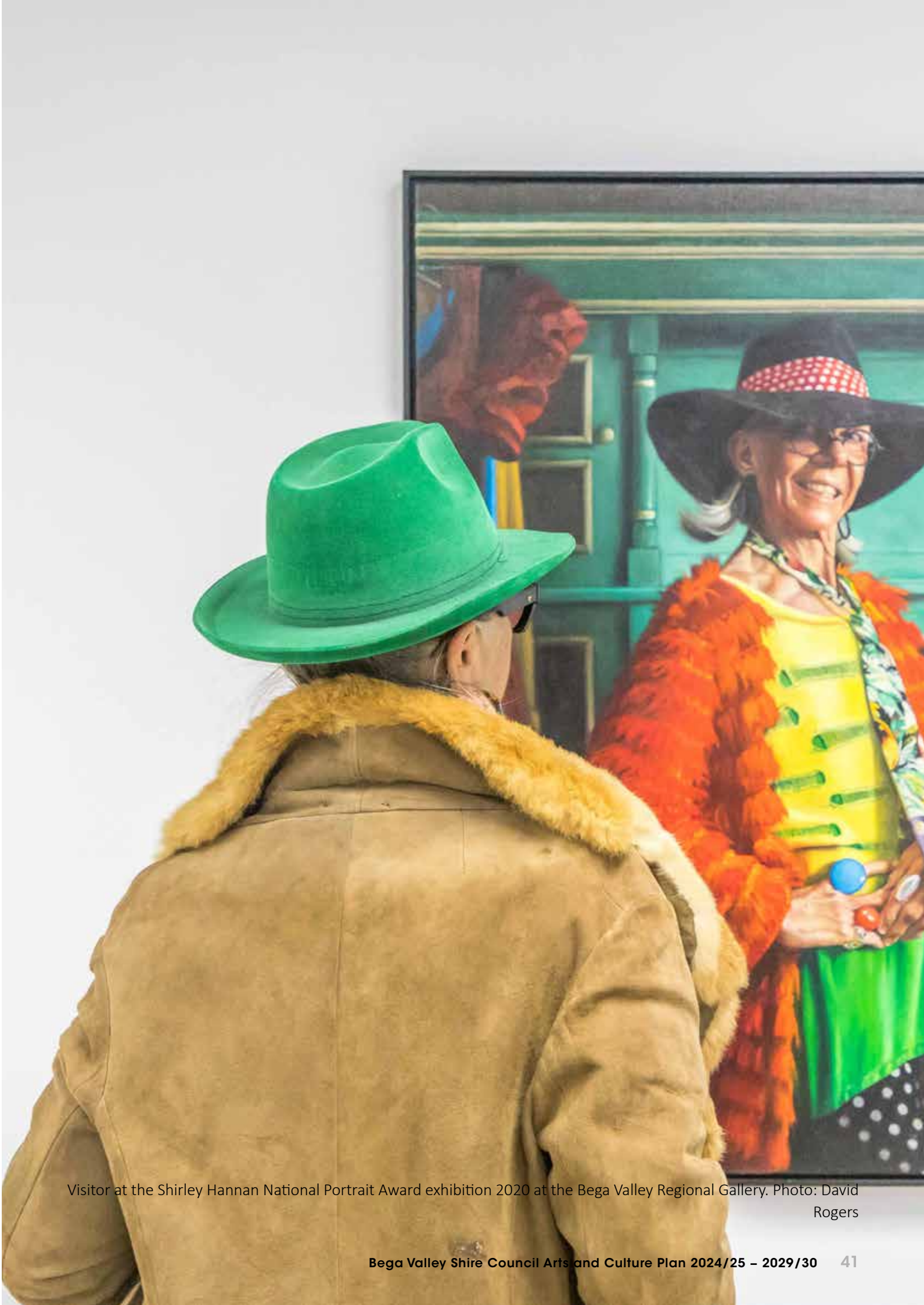
Visitor at the Shirley Hannan National Portrait Award exhibition 2020 at the Bega Valley Regional Gallery.