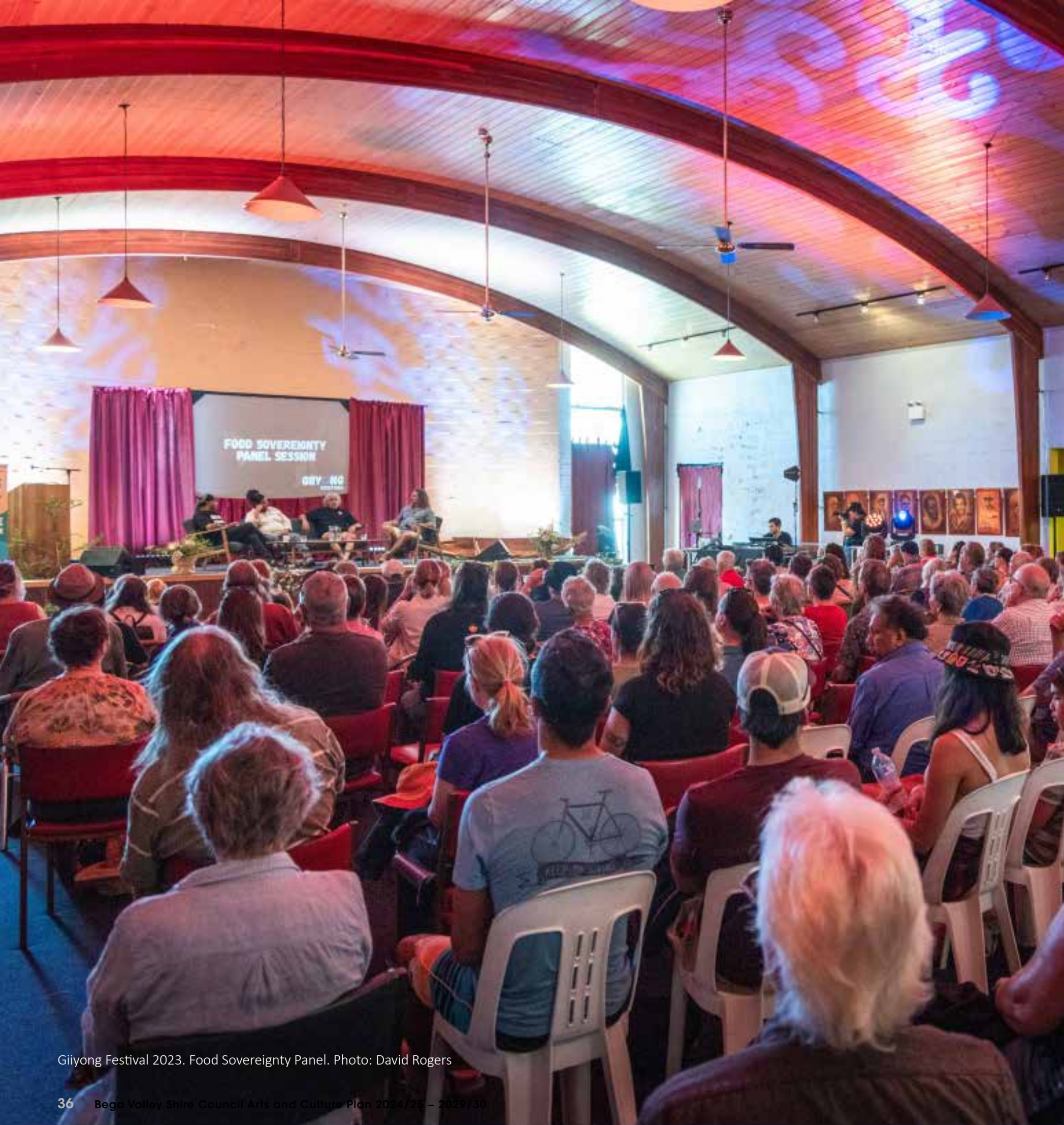
Giiyong Festival 2023. Food Sovereignty Panel.