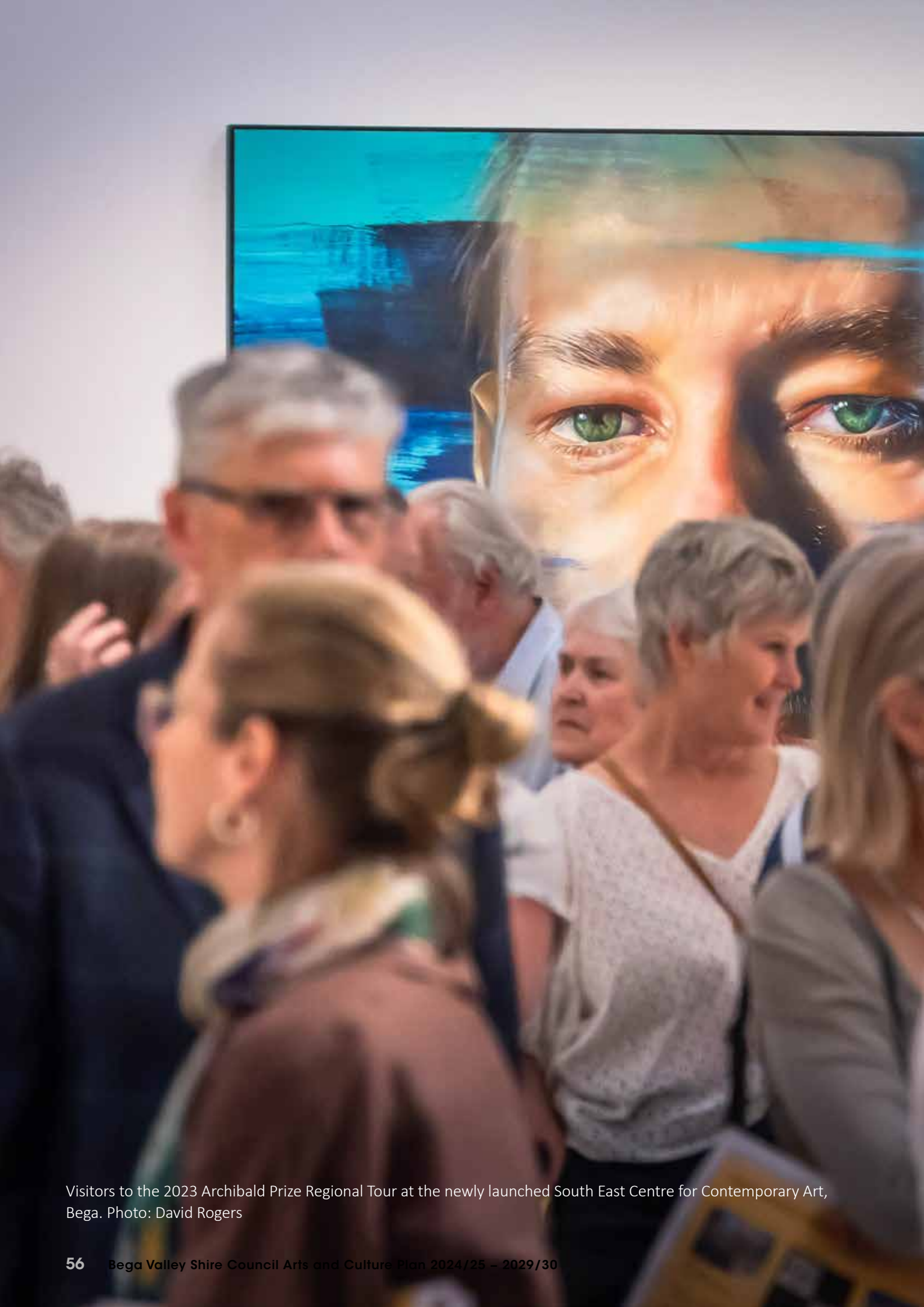
Visitors to the 2023 Archibald Prize Regional Tour at the newly launched South East Centre for Contemporary Art, Bega.