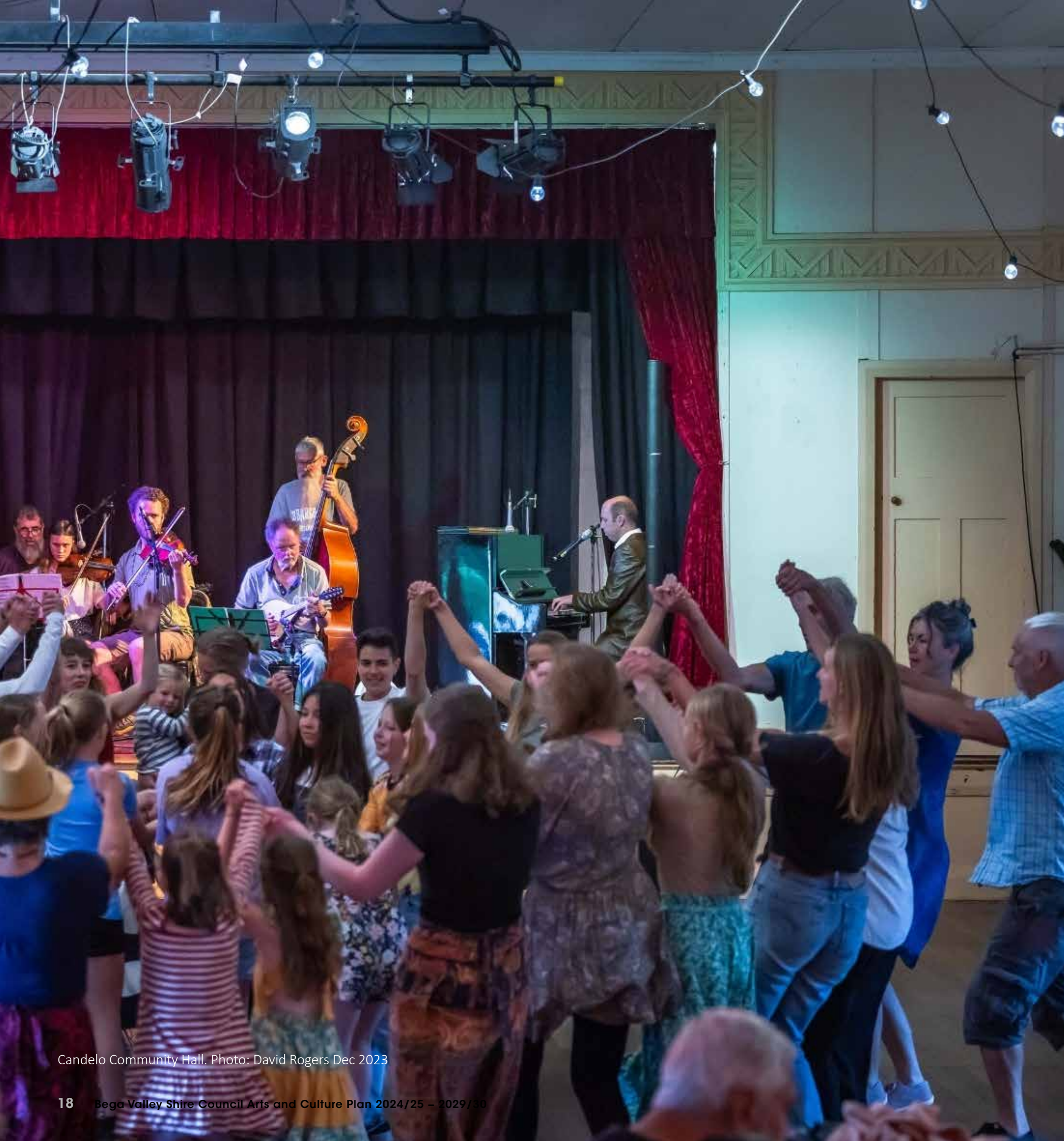
Candelo Community Hall. Dec 2023