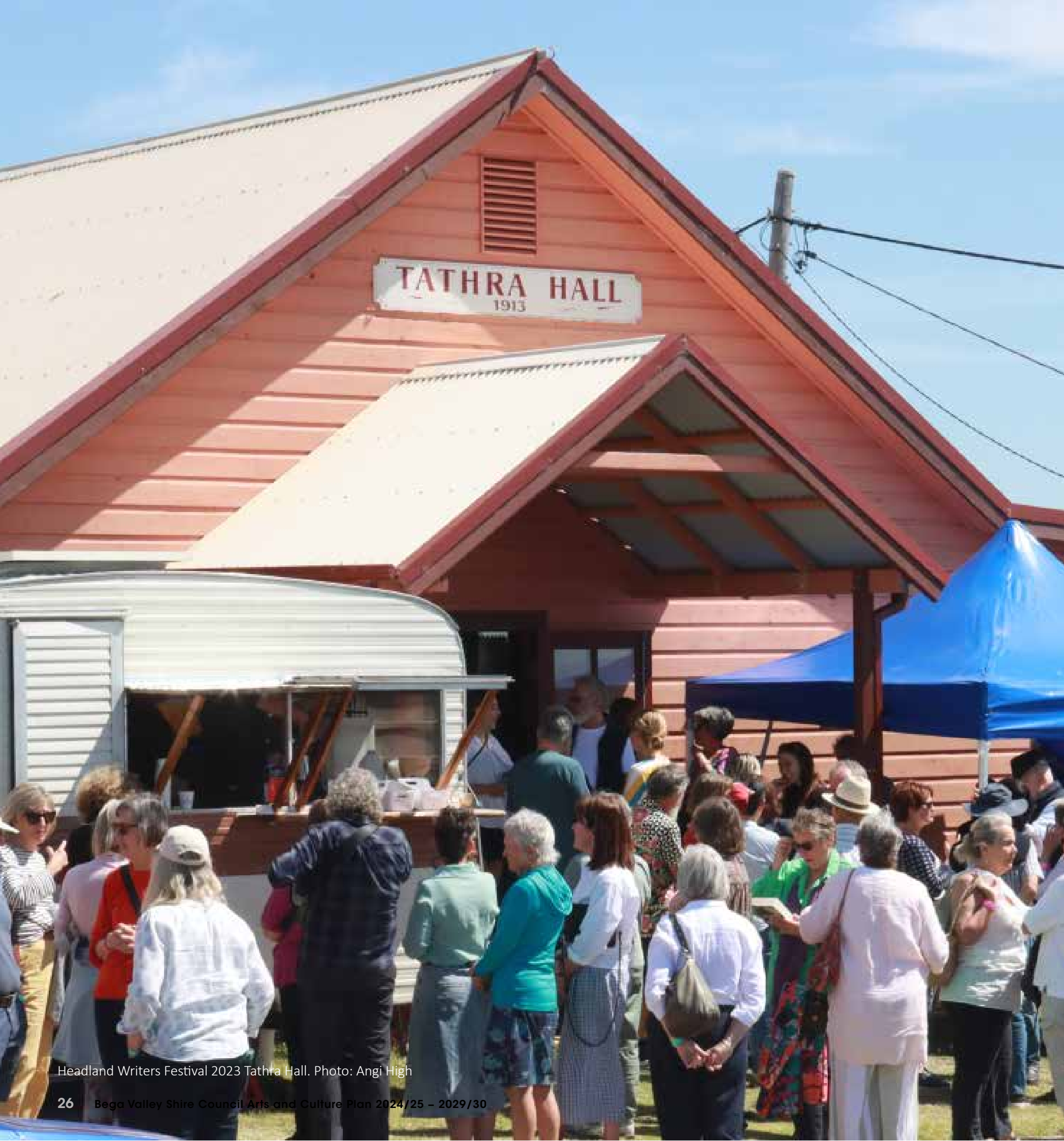
Headland Writers Festival 2023 Tathra Hall.