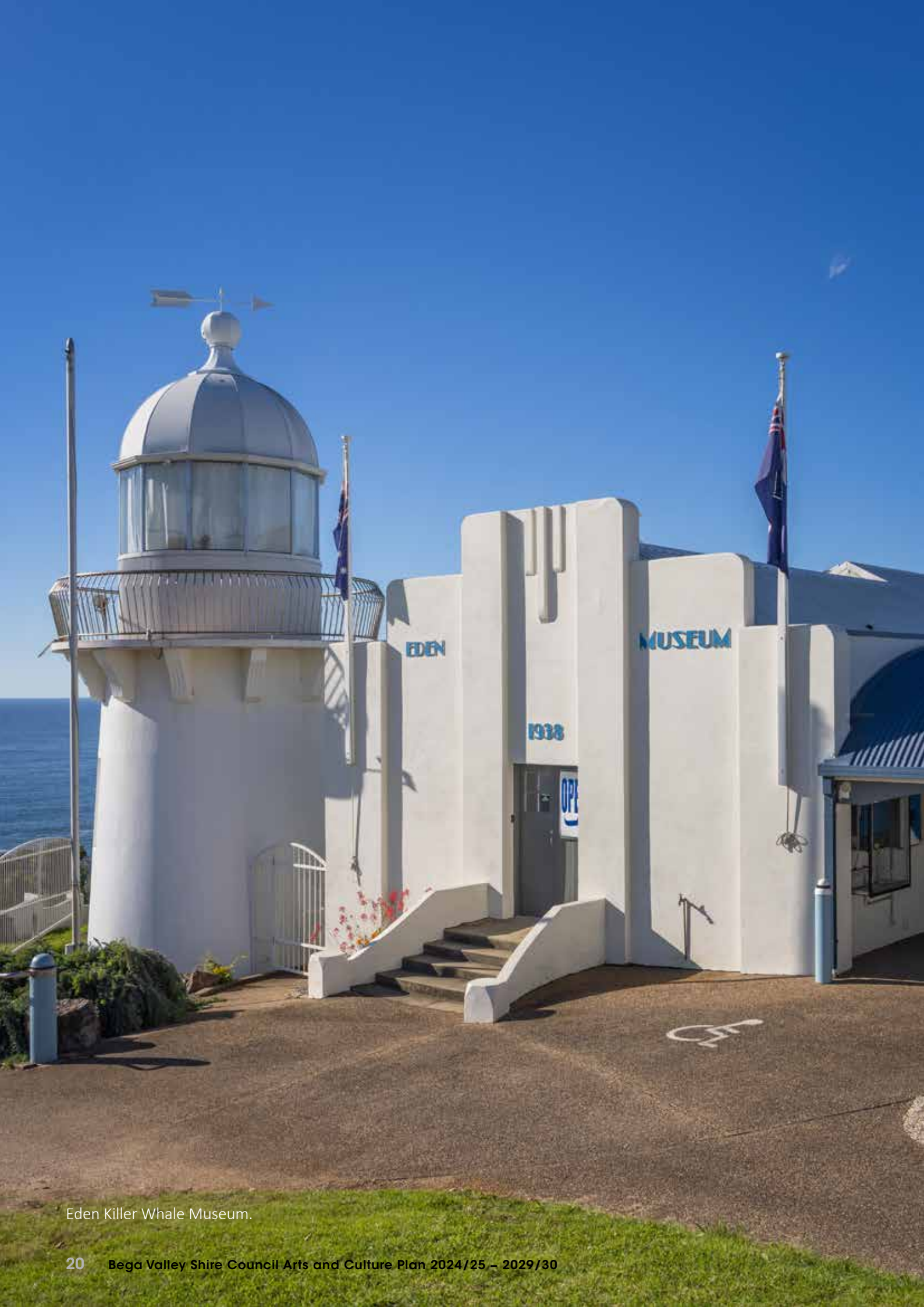
Eden Killer Whale Museum.