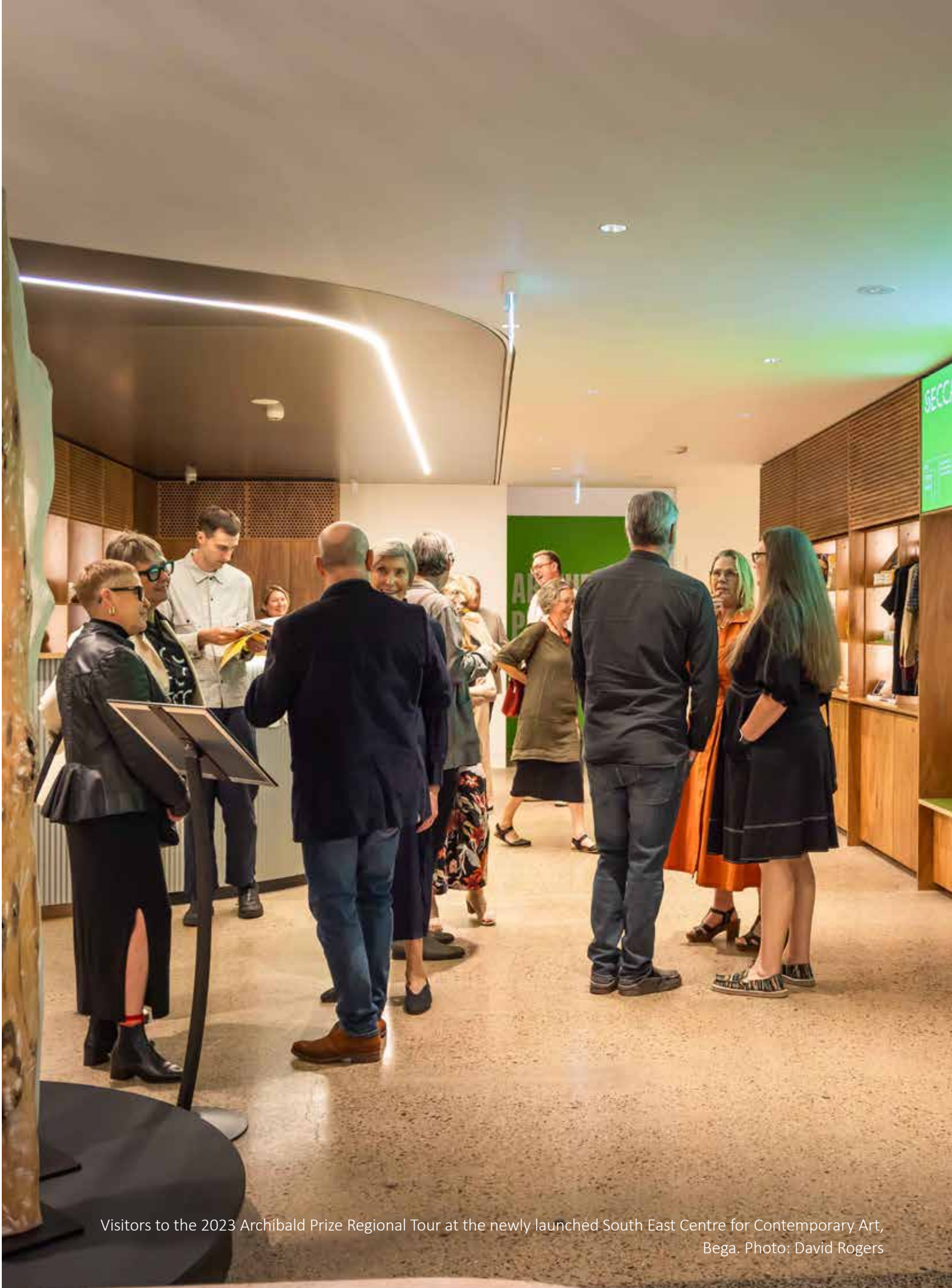
Visitors to the 2023 Archibald Prize Regional Tour at the newly launched South East Centre for Contemporary Art, Bega.