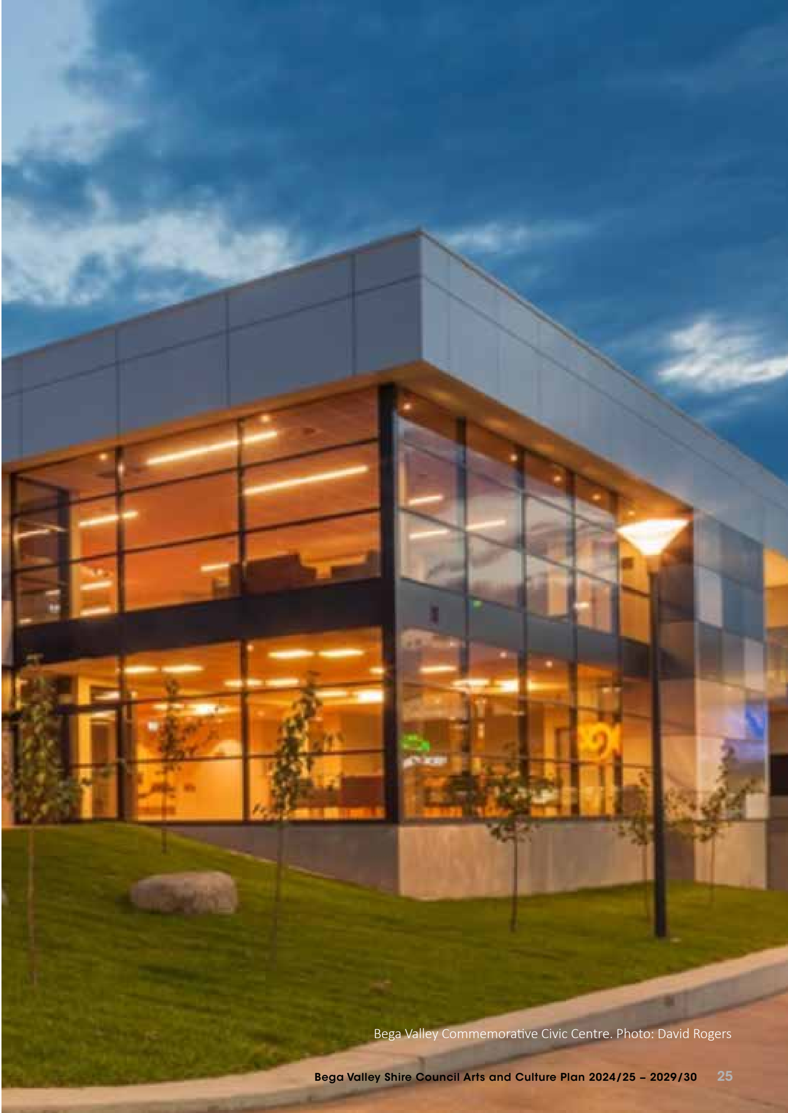
Bega Valley Commemorative Civic Centre.

Links to these plans can be found on the resources page 65.