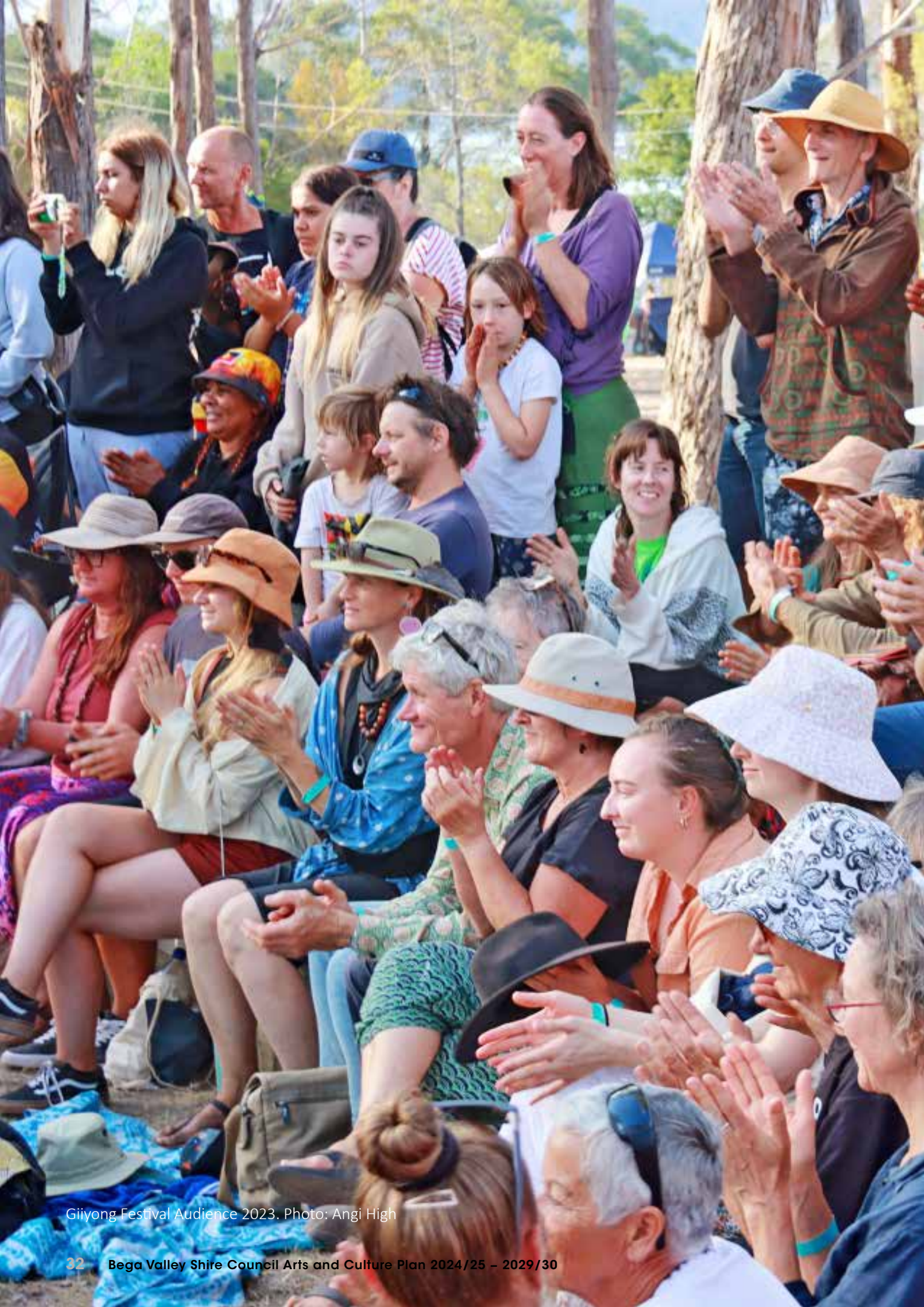
Giiyong Festival Audience 2023.

Following are a selection of actions from the five pillars in the Australian Government's National Cultural Policy, Revive, of relevance to the plan: