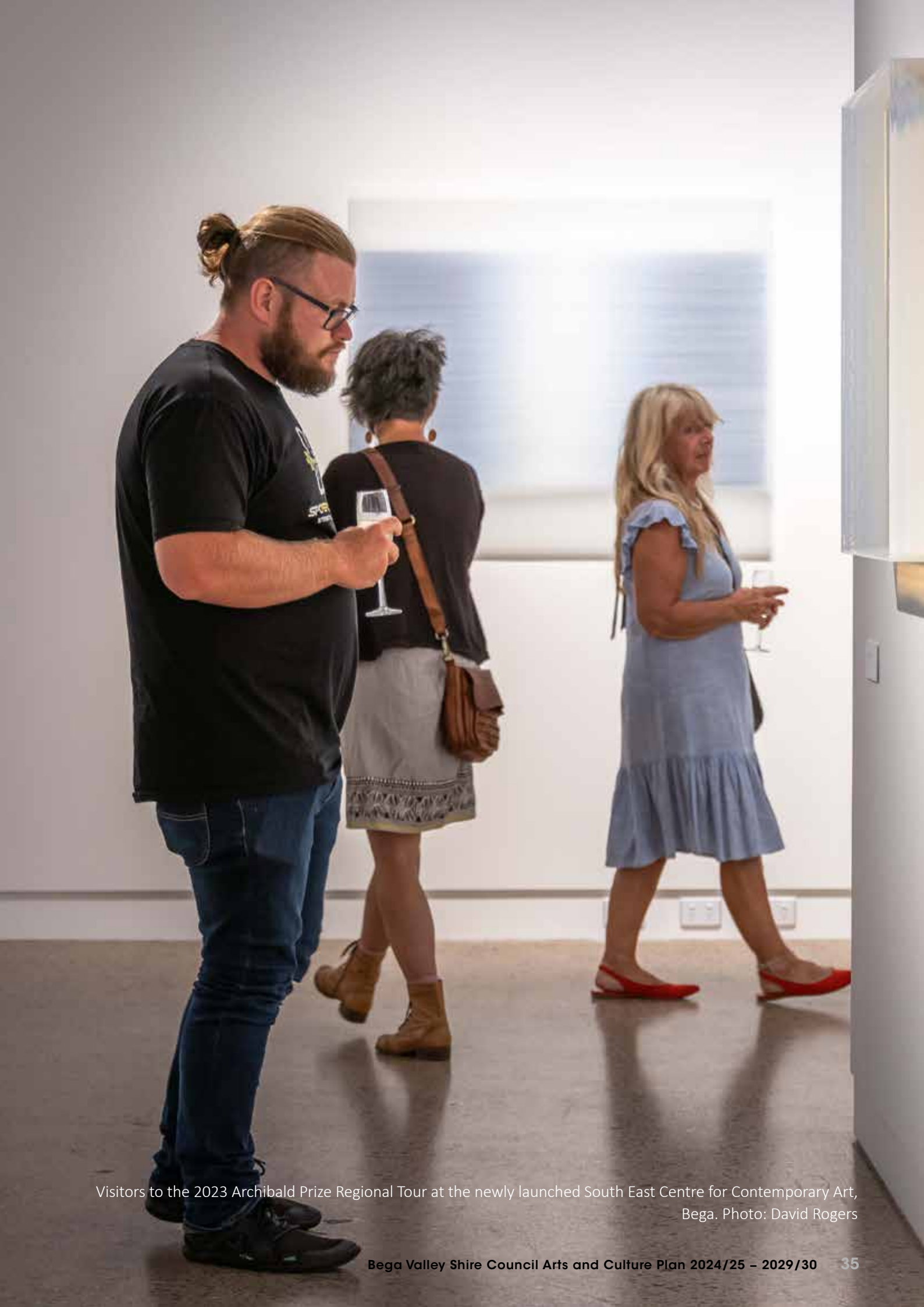
Visitors to the 2023 Archibald Prize Regional Tour at the newly launched South East Centre for Contemporary Art, Bega.