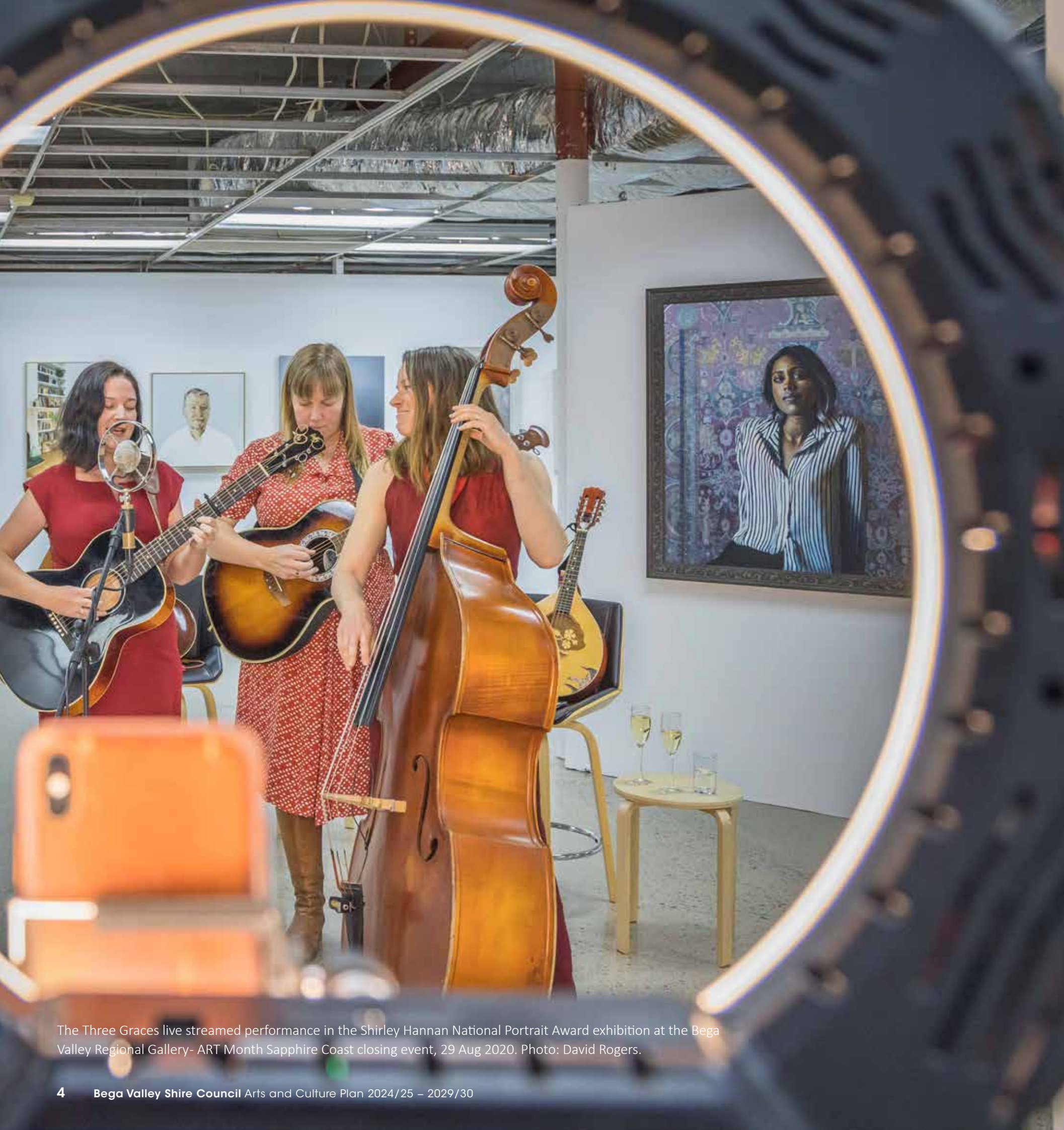
The Three Graces live streamed performance in the Shirley Hannan National Portrait Award exhibition at the Bega Valley Regional Gallery- ART Month Sapphire Coast closing event, 29 Aug 2020.