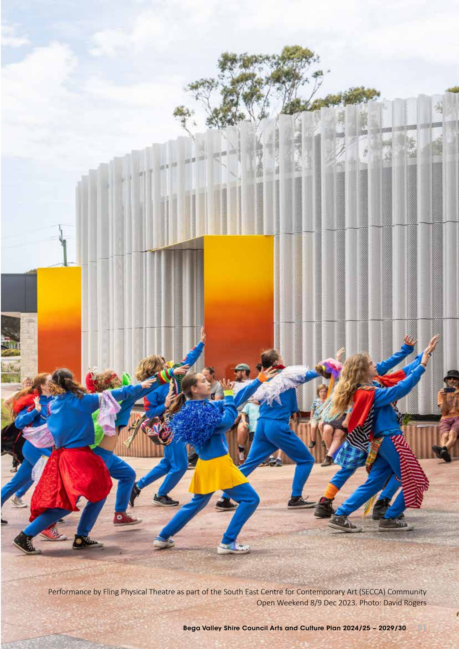
Performance by Fling Physical Theatre as part of the South East Centre for Contemporary Art (SECCA) Community Open Weekend 8/9 Dec 2023.