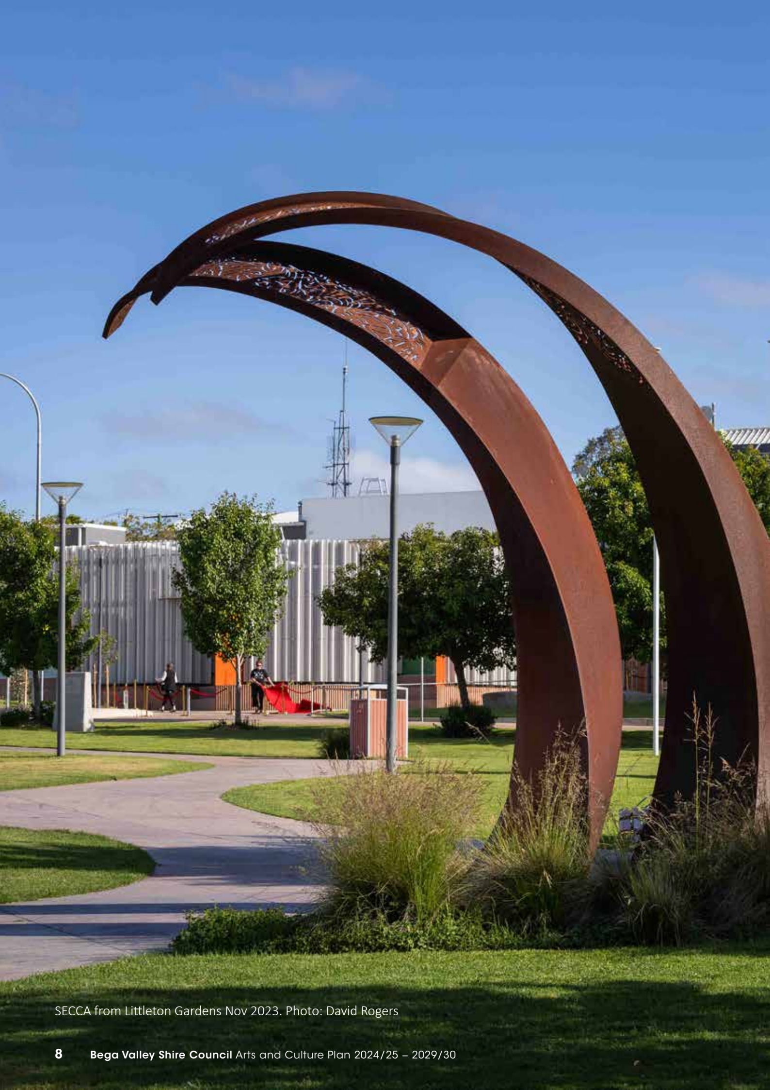
SECCA from Littleton Gardens Nov 2023.