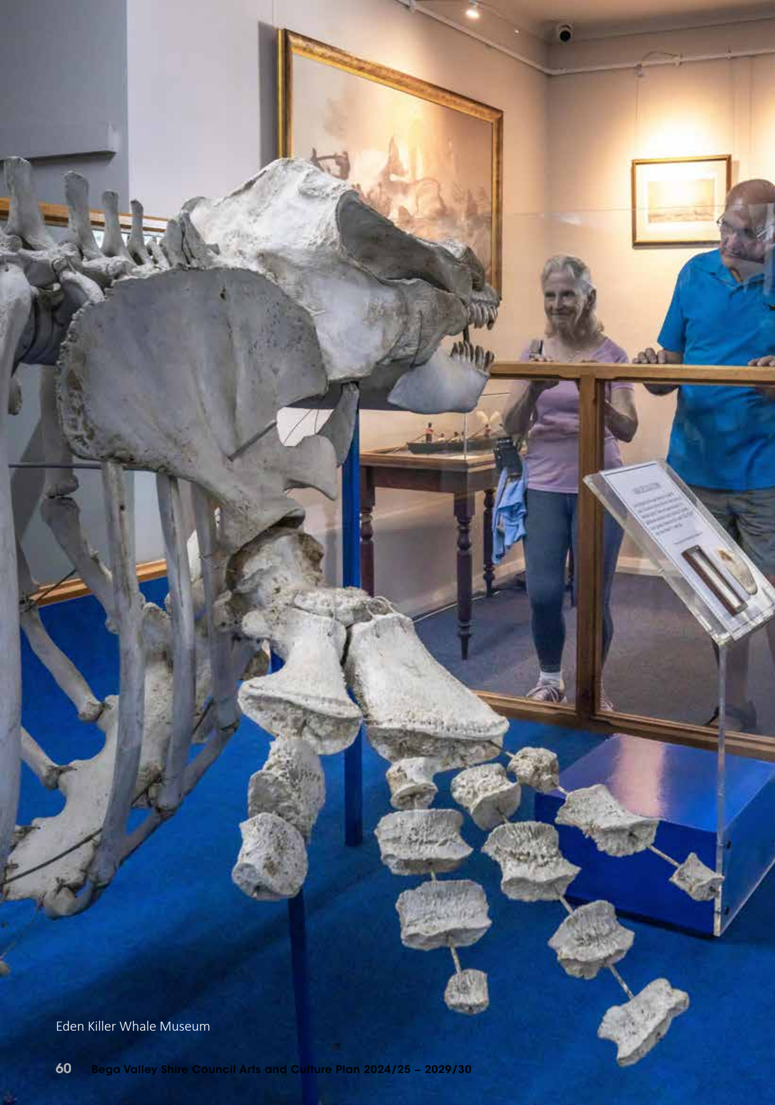
Eden Killer Whale Museum