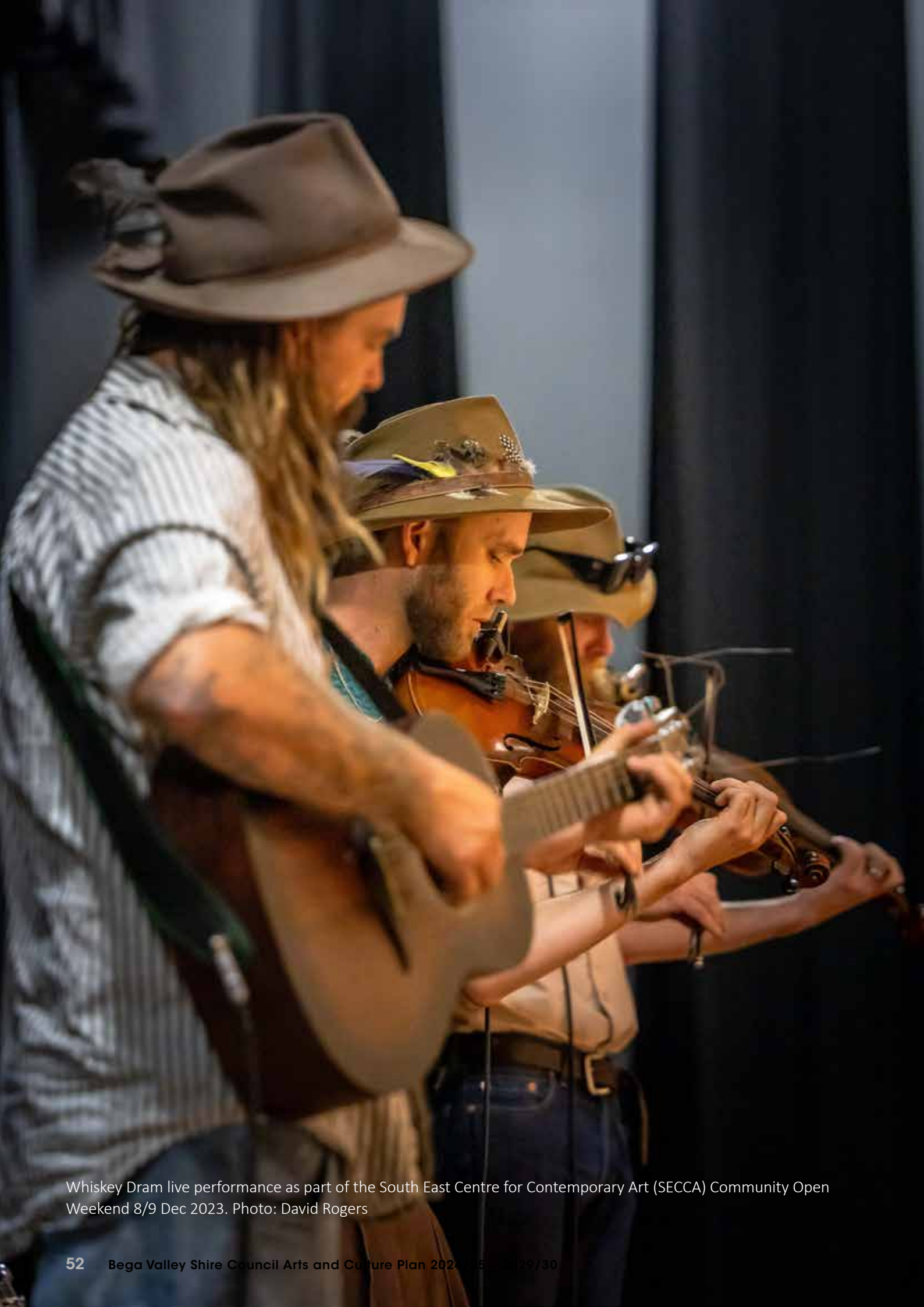
Whiskey Dram live performance as part of the South East Centre for Contemporary Art (SECCA) Community Open Weekend 8/9 Dec 2023.